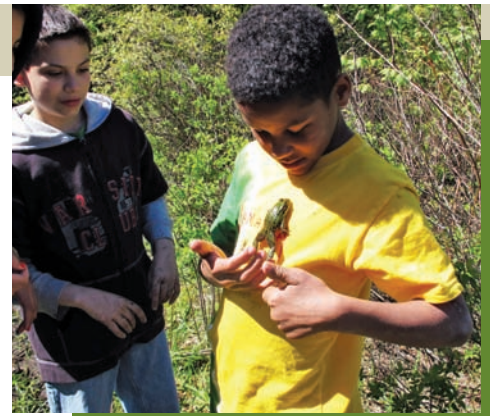
Inner city children get to explore new environments and make new friends when they come to BCCYMCA.

The Urban Assembly is a non-profit organization that has created and manages a community of small New York City public schools dedicated to preparing students from under-resourced neighborhoods for success